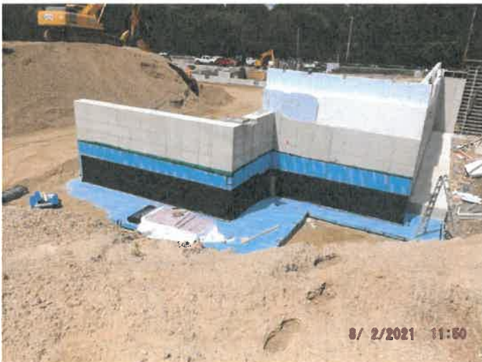
Photo depicts the progress of waterproofing.