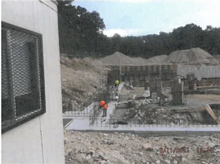
Photo depicts the progress of high wall panel installation.