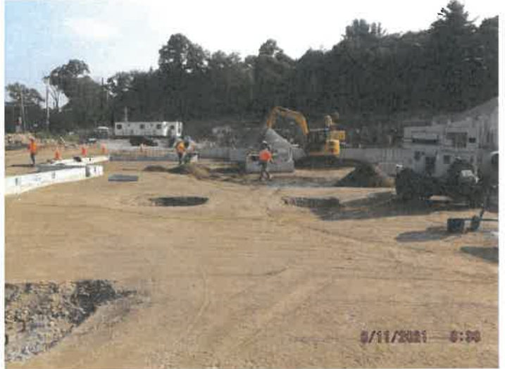
Photo depicts the site progress along with footing and foundation progress.