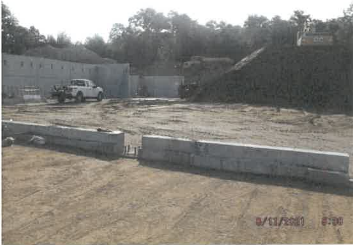
Photo depicts the site progress along with footing and foundation progress.