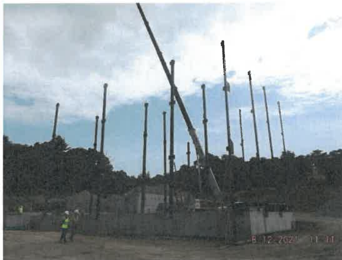
Photo depicts the steel erection.