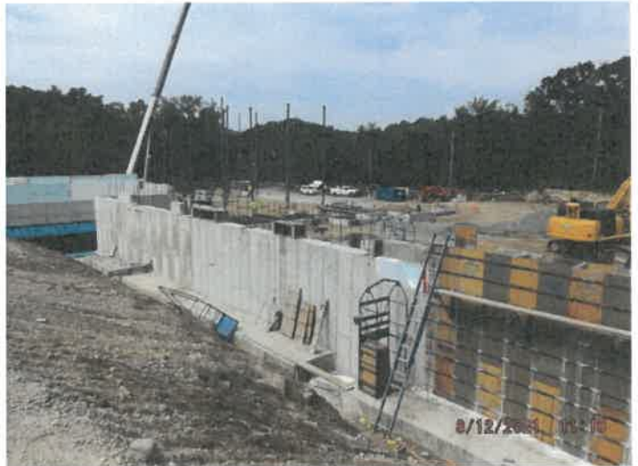
Photo depicts the site progress along with footing and foundation progress.