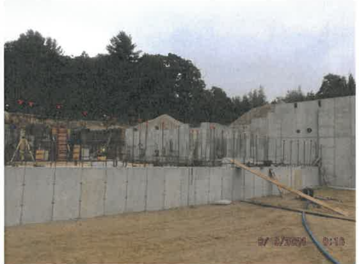
Photo depicts the progress of high wall panel installation.