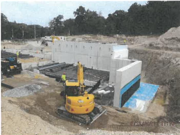
Photo depicts the site progress along with footing and foundation progress.