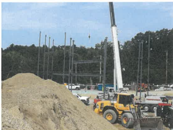
Photo depicts the steel erection.