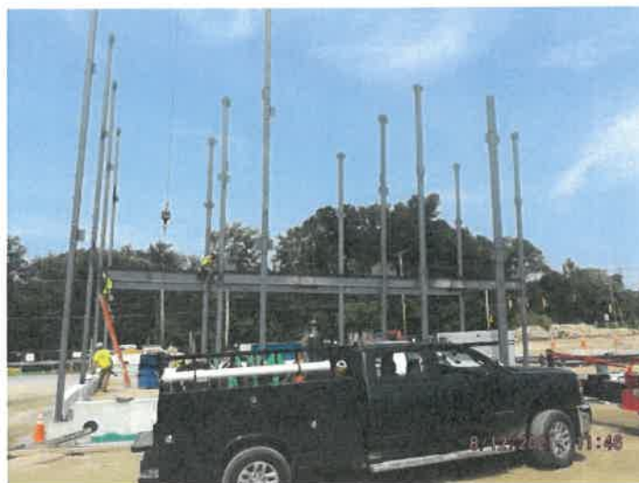
Photo depicts the steel erection.