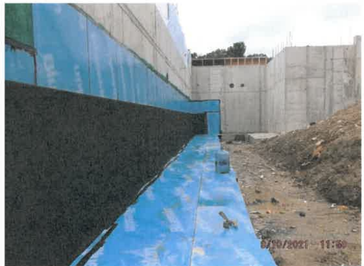
Photo depicts the progress of waterproofing.