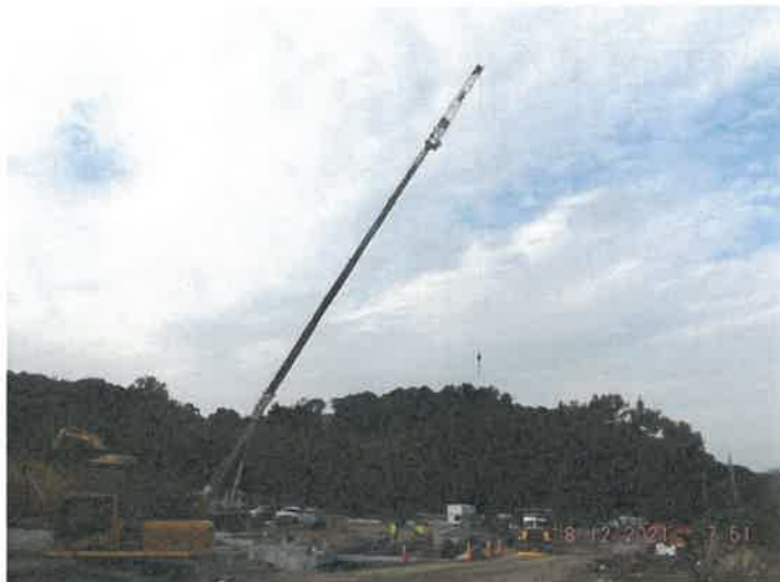
Photo depicts the arrival of the crane for steel.