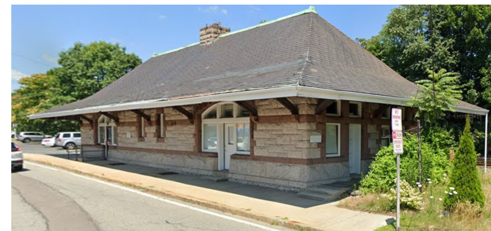
Seating Canopy Design Precedent