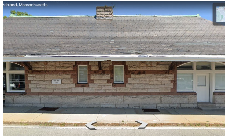
Train Station Façade Materials