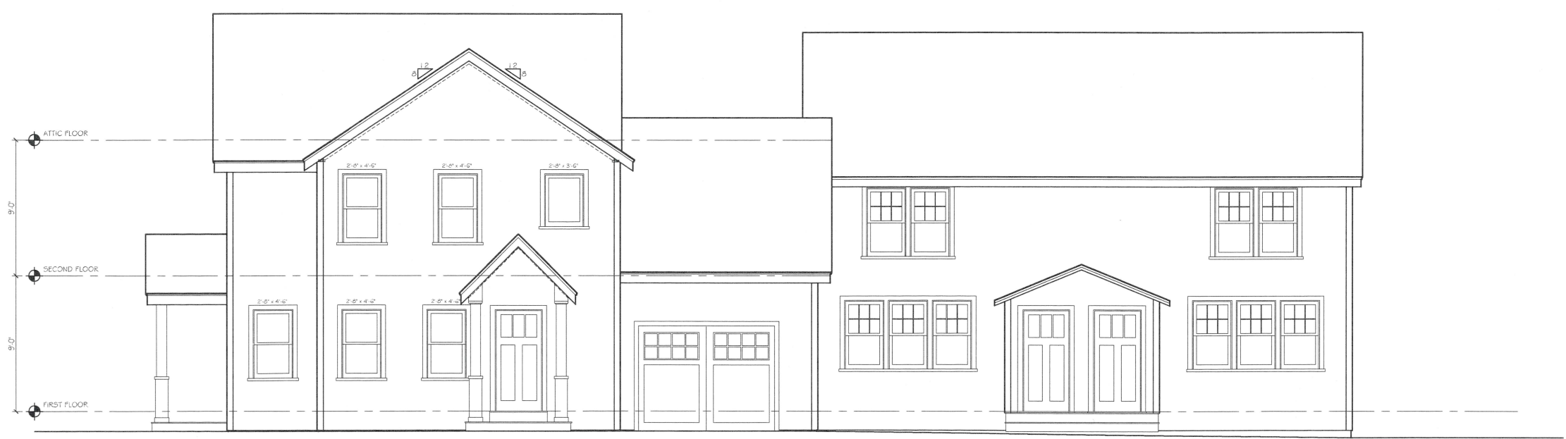
RIGHT SIDE ELEVATION 1/4" = 1'-0"