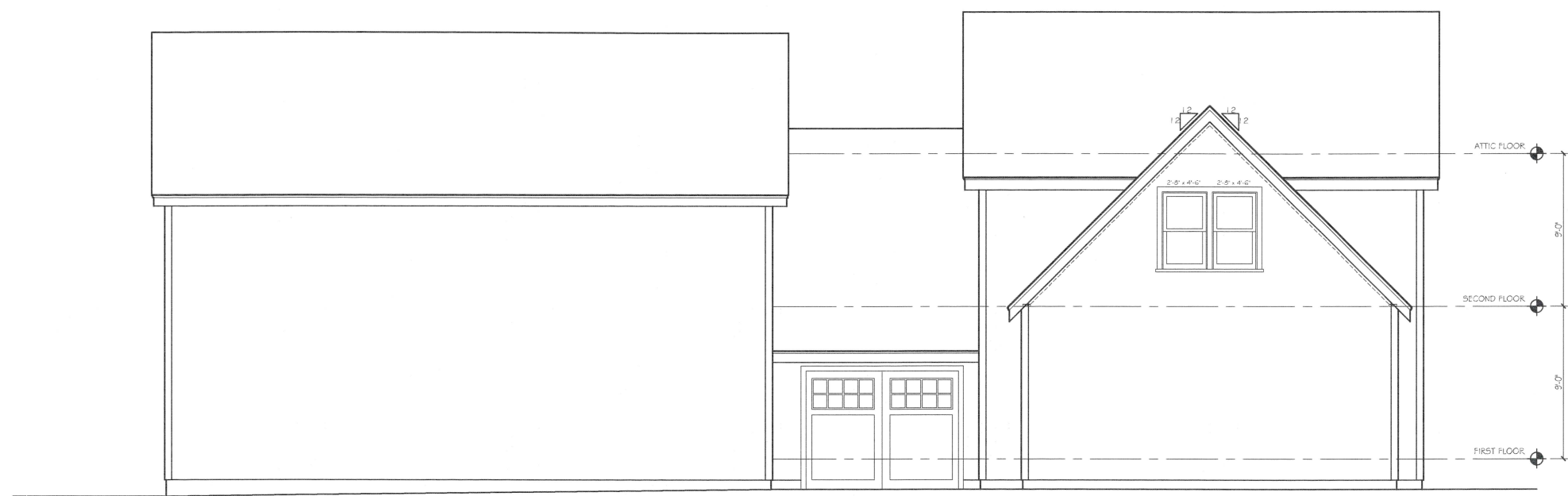
LEFT SIDE ELEVATION 1/4" = 1'-0"