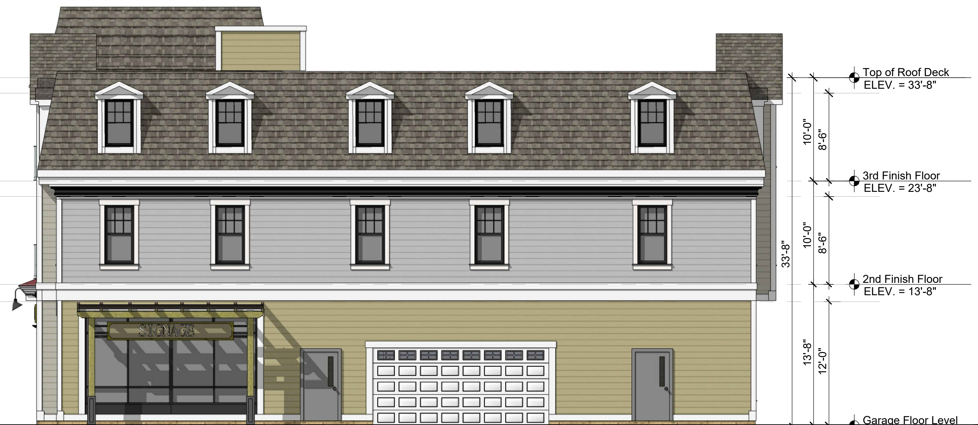
PROPOSED RIGHT ELEVATION (GREENHALGE ROAD)