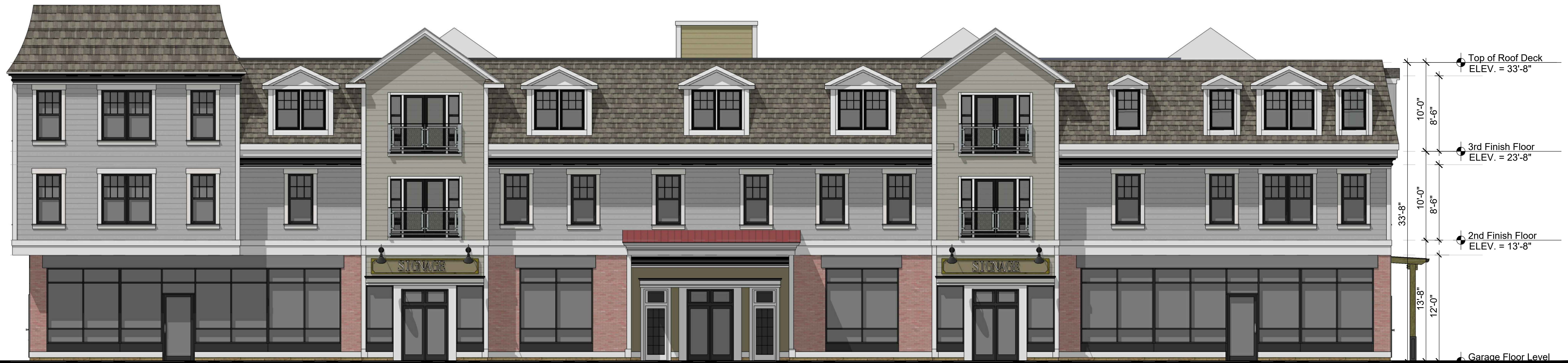
PROPOSED FRONT ELEVATION (POND STREET)