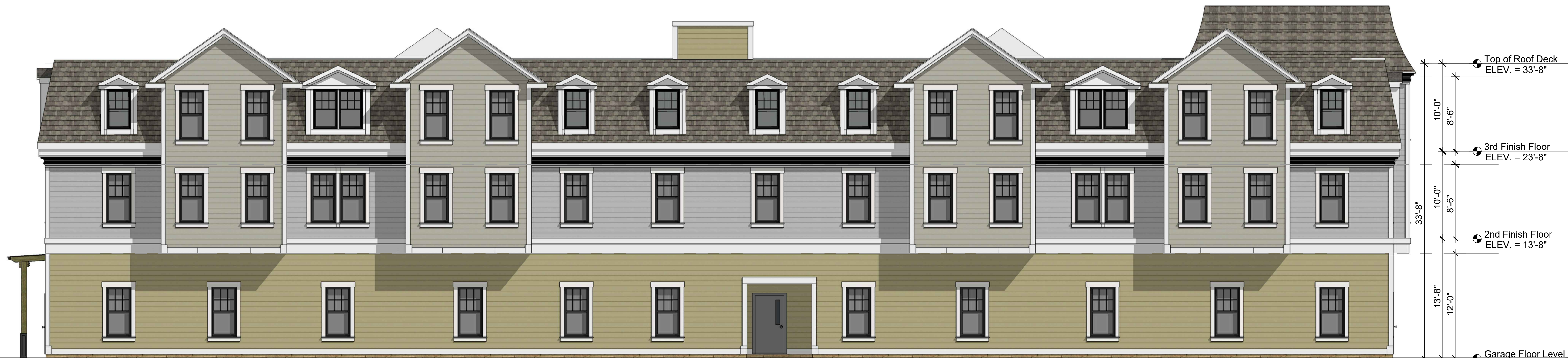
PROPOSED REAR ELEVATION (REAR PARKING LOT)