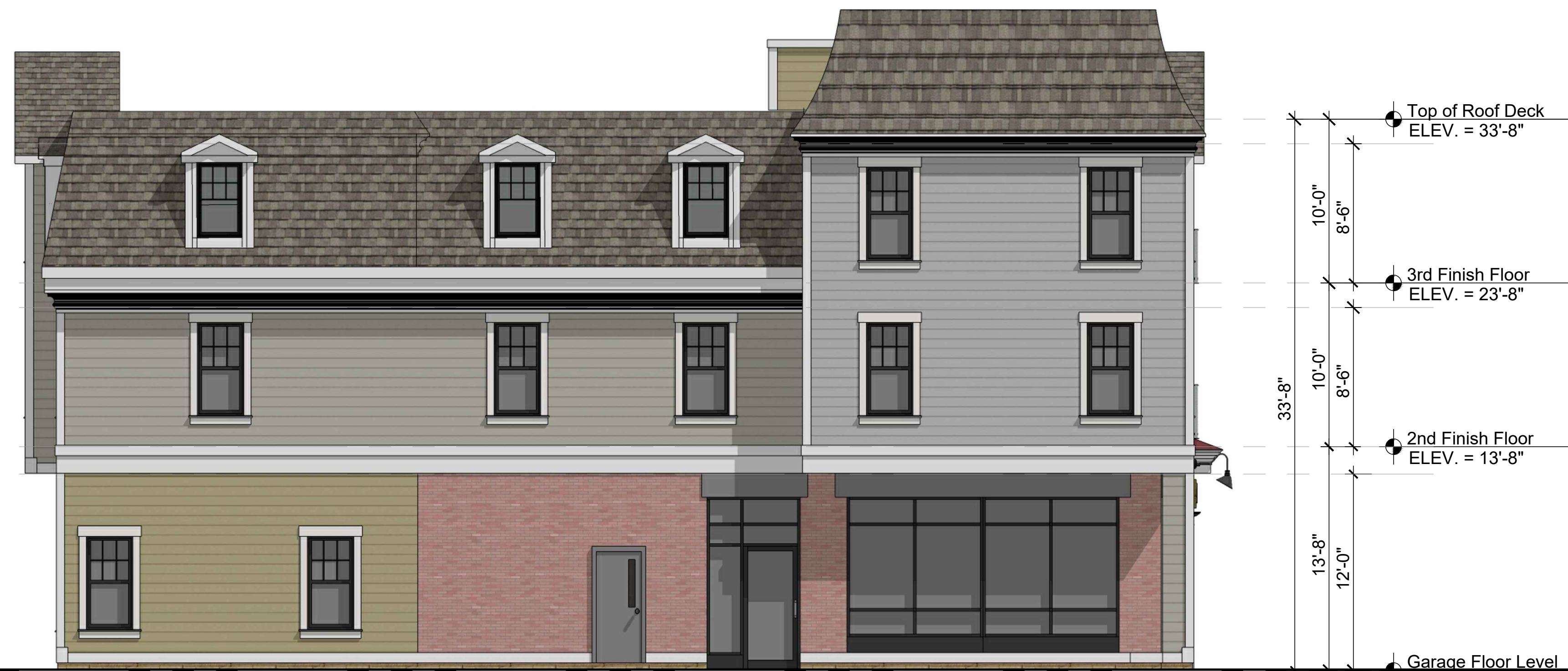
PROPOSED LEFT ELEVATION (DOUGLAS ROAD)