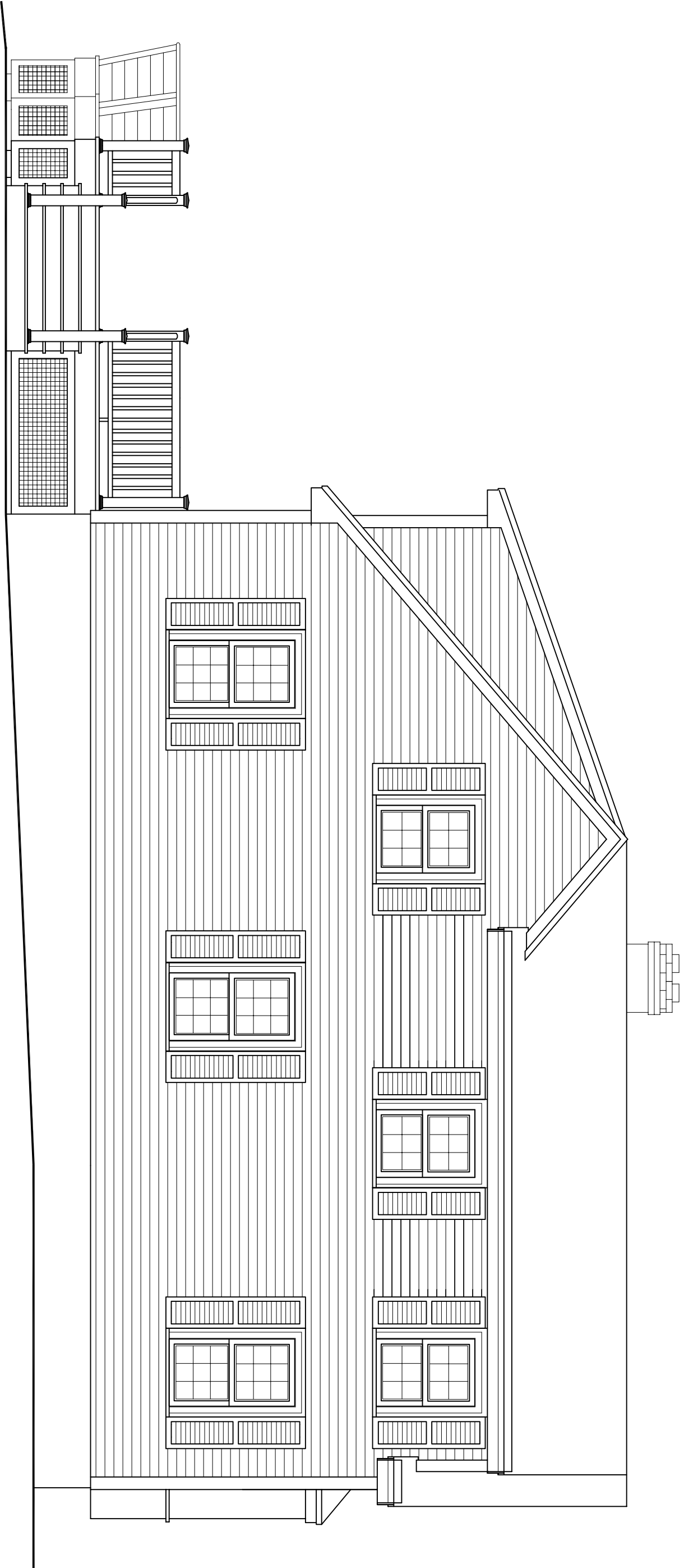
Proposed Left Side Elevation