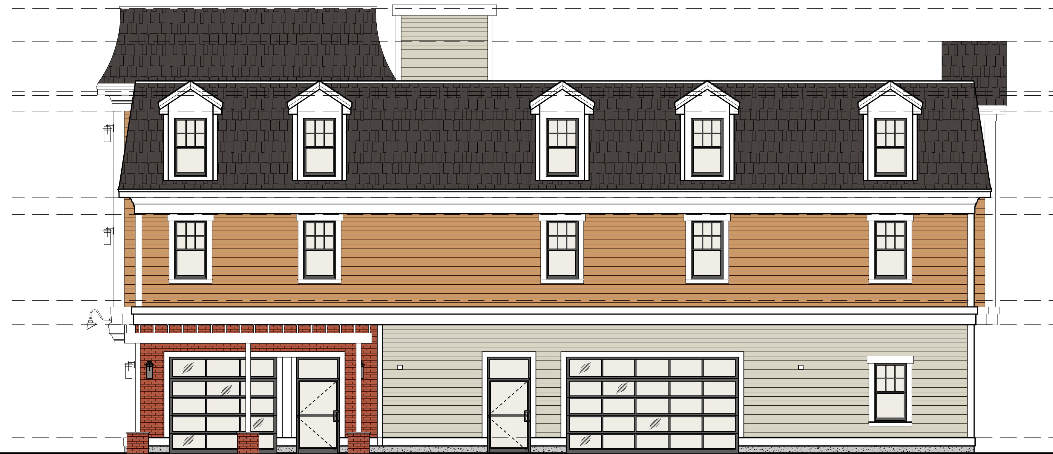
2 PROPOSED GREENHALGE ROAD ELEVATION SCALE: 3/16" = 1'-0"