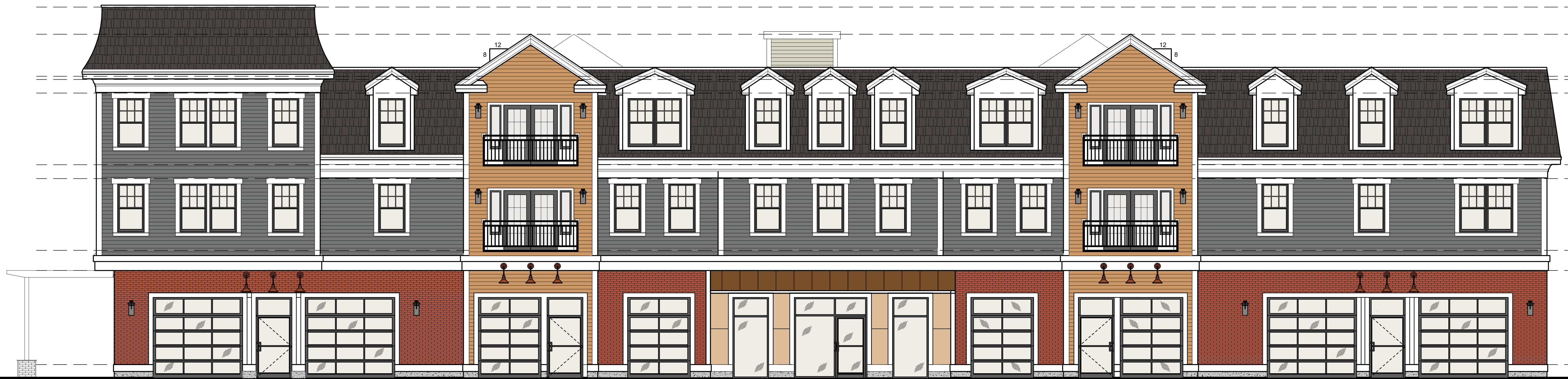
1 PROPOSED POND STREET ELEVATION 3/16" = 1'-0"