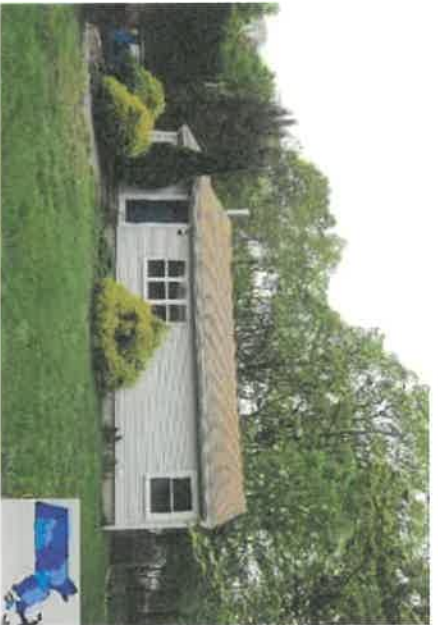
14 BARTLETT RD

% Good 58 Economic % Good Override % Complete 100 Functional C&D Factor