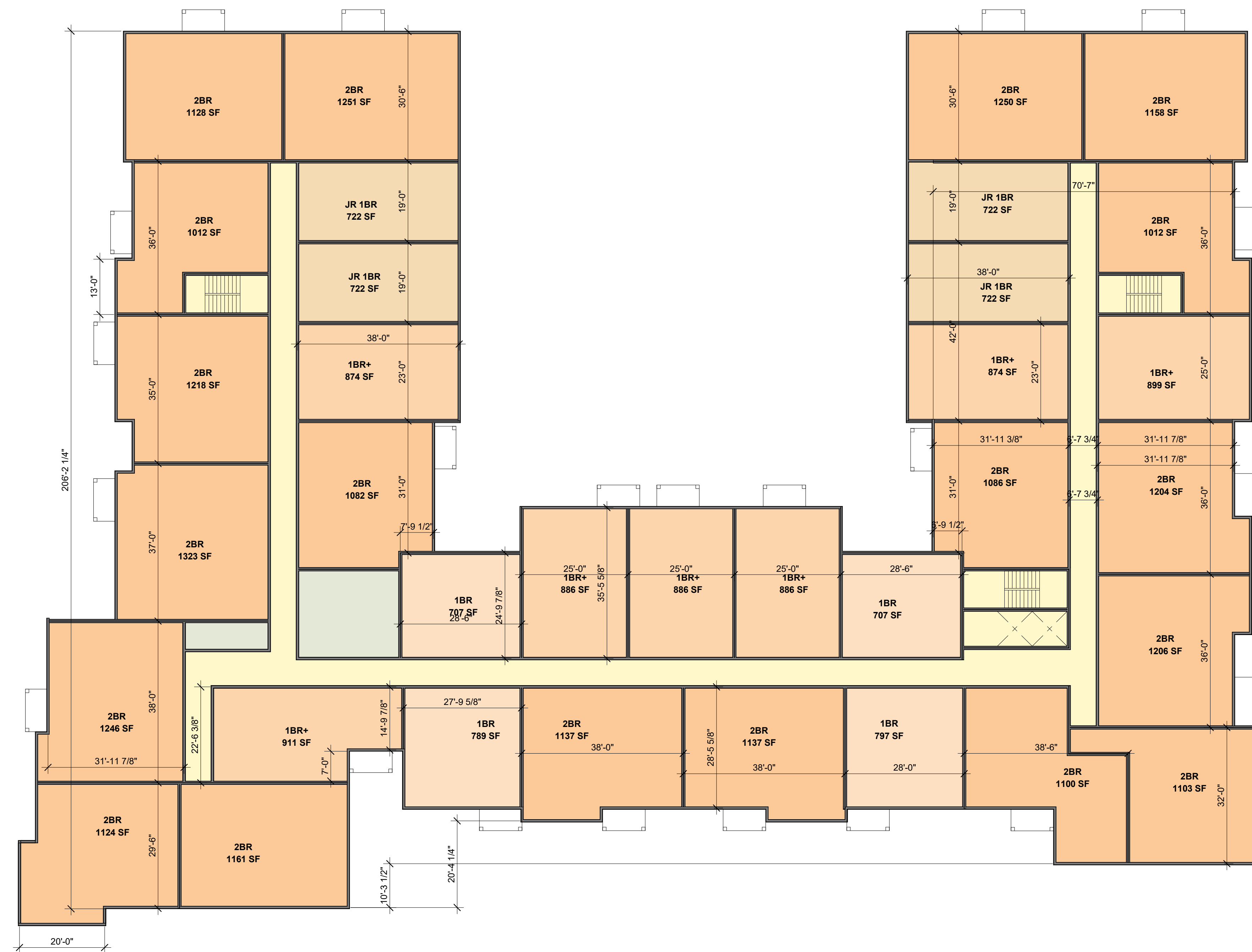
1 LEVEL 2 FLOOR PLAN 1/16" = 1'-0"